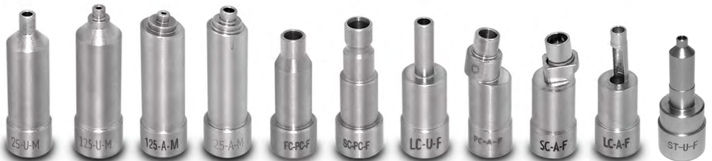
25-U-M 125-U-M 125-A-M 25-A-M FC-PC-F SC-PC-F LC-U-F FC-A-F SC-A-F LC-A-F ST-U-F